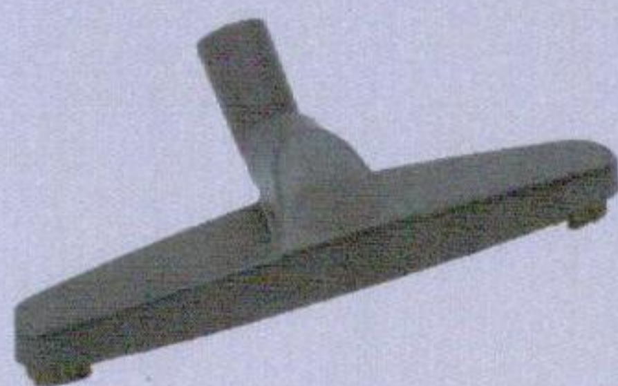
Notched in front to prevent bull-dosing of dirt.