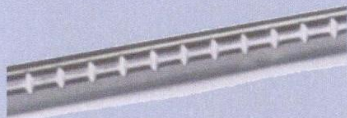
Ratchet adjusts to user's needs.