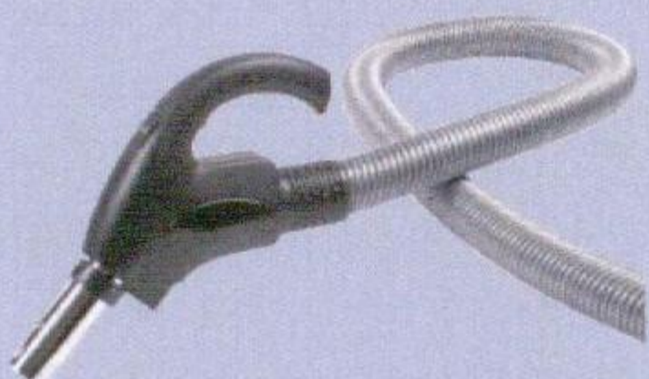
The slim fit design reduces in-hand weight and provides years of trouble free use.