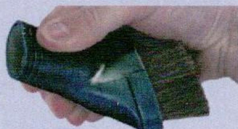
Molded in vinyl for a soft touch to protect fine furnishings.