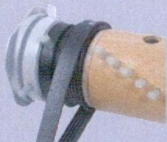
Quiet Drive...V-Technology for continuous contact between brush and belt